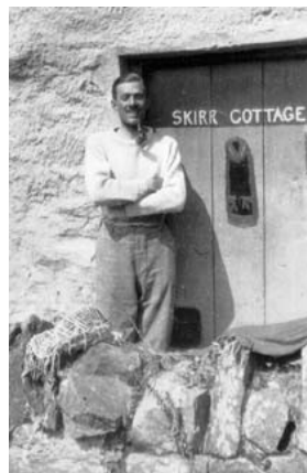
Outside his cottage in Devon in the early 1920s