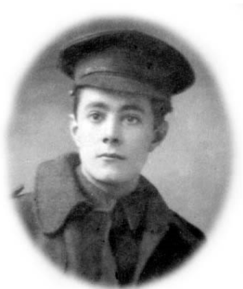
Henry Williamson as a young soldier in 1915